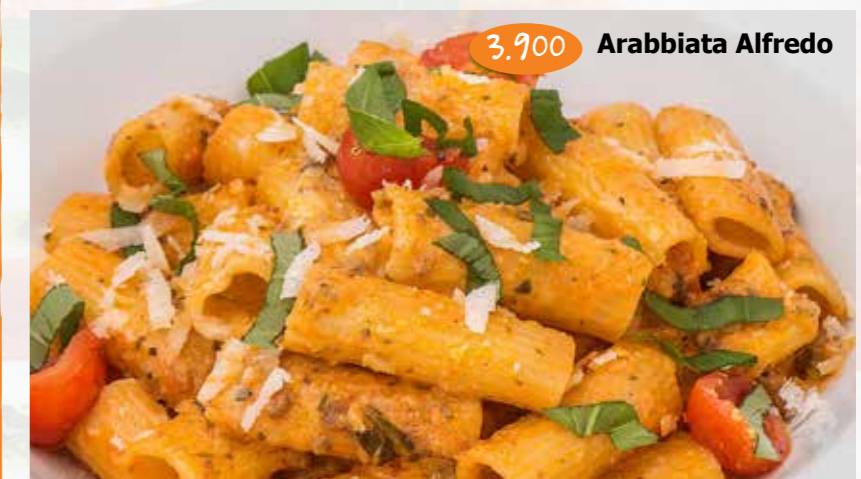
3.900 Arrabbiata Alfredo

Kids Pasta Pasta and freshly made tomato sauce with cheese topping BD 1.900