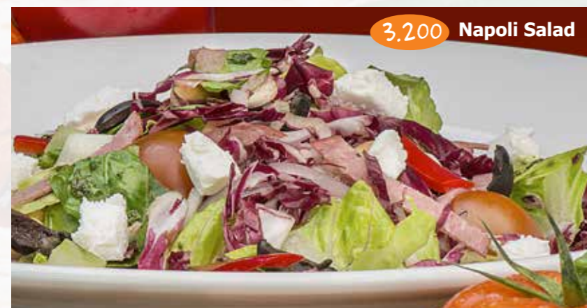
3.200 Napoli Salad