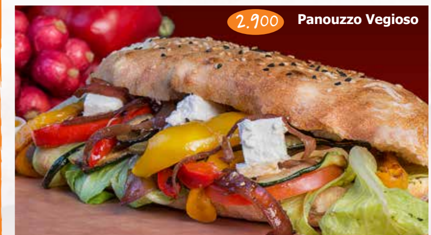
2.900 Panouzzo Vegioso